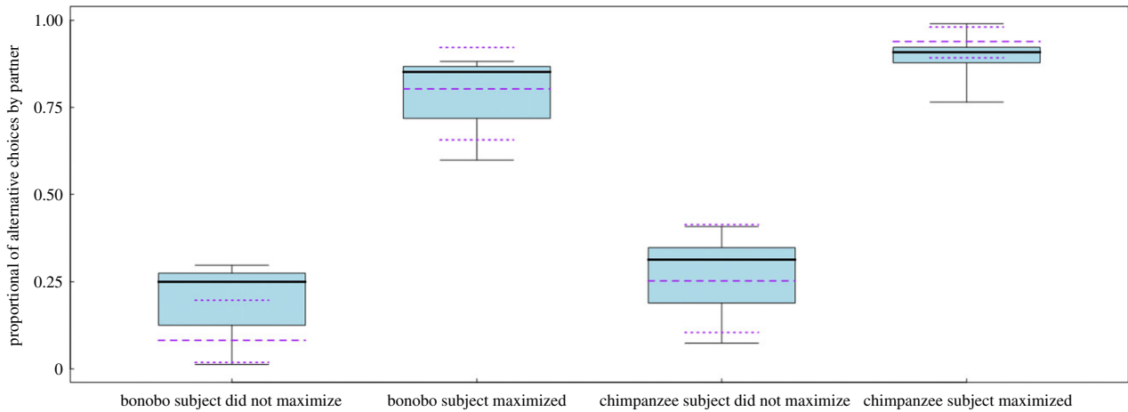
Figure 3. Proportion of trials in which the responders accessed the alternative as a function of the ‘proposers’ decisions. Differences between species and between previous proposers decisions are significant. The box plot represents the median and q1 and q3 quartiles. The dotted lines in purple represented the fitted values of the model and the predicted 95% CI. (Online version in colour.)

material, figure S3). In addition, we found an effect of session suggesting that individuals maximized more by the end of the study. However, this result might be explained by the fact that the last two conditions were control conditions in which proposers should have maximized their gains. In fact, an updated model without including the control sessions confirmed no session effects (see electronic supplementary material, for further details of the models).