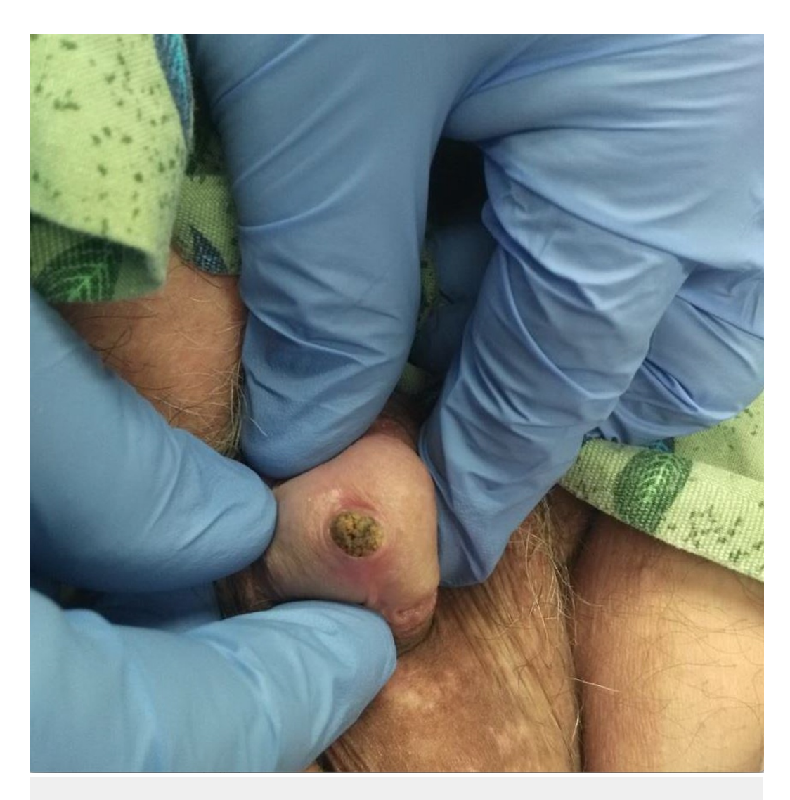
FIGURE 1: Stone obstructed at the distal urethra

Physical examination revealed a stone obstructing the distal urethra.