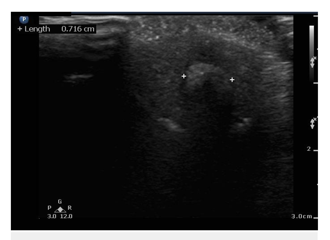
FIGURE 2: Transverse urethra with impacted stone

The ultrasound was also placed along the long axis of the penile shaft and glans demonstrating a hyperechoic, circular structure with posterior acoustic shadowing (Figure 3).