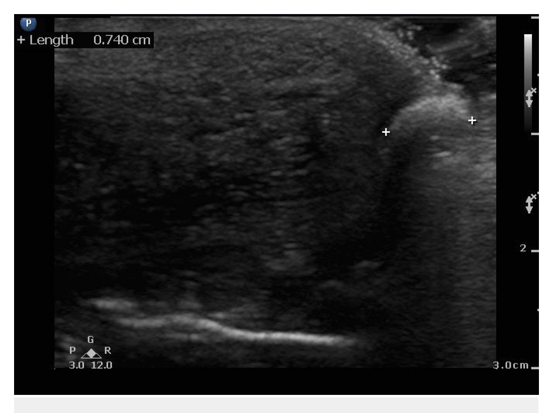
FIGURE 3: Sagittal urethra with impacted stone

The ultrasound was also placed along the long axis of the penile shaft and glans demonstrating a hyperechoic, circular structure with posterior acoustic shadowing (Figure 3).