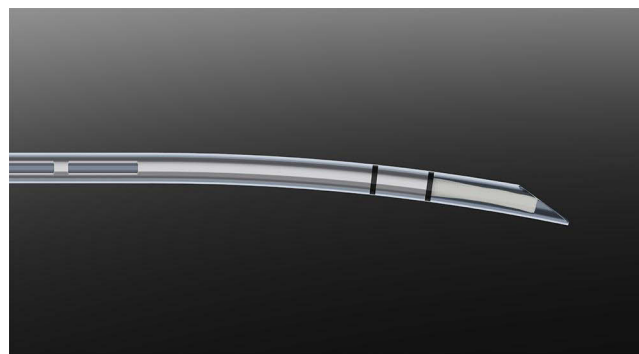
Figure 2 The scleral allograft microtrephined into a minimally-modified, bio-scaffolding implant.

Using scleral allograft to enhance uveo-scleral outflow is another promising clinical application of ab-interno scleral tissue reinforcement (Figure 2). Homologous conforming bio-tissue has potential advantages over rigid implantable hardware devices because of its porosity, hydrophilic aqueous permeability and structural stability without the fibrosis-inducing bio-mechanical mismatch to the surrounding native tissues. Intraocular implantation of a scleral allograft in the supraciliary space has been shown to structurally enhance and maintain the suprachoroidal outflow because of the conductive and reinforcing properties of the allograft acellular matrix (Figure 3). 53 Early results are encouraging in that respect - in a study with 12 months of follow-up, flexible conforming bio-tissue was well tolerated without anterior