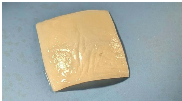
Figure 1 Scleral patch graft.

It is important to ensure that the tissue sterilization and storage method does not change the structural properties of sclera, which could compromise its performance. The ideal method should combine the maximum capacity to eliminate pathogens while keeping the scleral integrity as much as possible. Sterilization with gamma radiation allows for reliable long-term storage and has become the standard method for sclera storage. 22 The use of gamma-irradiated tissue has the advantage of inactivating most pathogens, decreasing the risk of disease transmission, and is a highly standardized process consistent with the sterilization of most medical devices. 23 Several methods have been described for scleral tissue storage, including short-term storage (up to 30 days) using sterile saline with gentamicin and longer storage, allowing the tissue to be easily stored for up to 2 years. 9,10,24,25 The last can be achieved using glycerin, 95% ethanol or freeze-drying. Glycerin has traditionally been used for scleral storage, having a great ability to maintain structural integrity compared to other storage methods. 17 However, it can be ineffective for the inactivation of some organisms, like specific viruses and prions. Alcohol preservation (ethanol 70–95%) offers robust tissue sterilization and is a simple, cost-effective