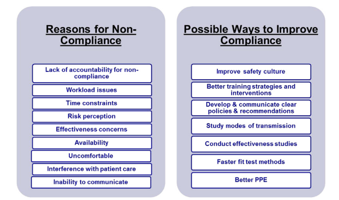
Fig 2. Problems and possible solutions related to respiratory protection usage in health care.

The numerous issues expressed by HCP demonstrate the need for respiratory protection that is designed to specifically meet their needs. Furthermore, many policy experts believe that the science to drive health care respiratory protection policies is still missing. In 2007, NIOSH's National Personal Protective Technology Laboratory charged an IOM committee to examine research directions, certification and establishment of standards, and risk assessment issues