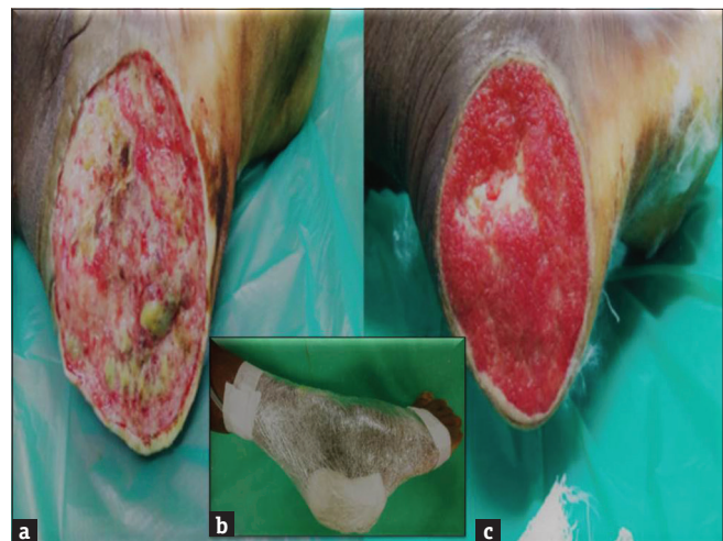
Figure 2: Negative pressure wound dressings (a) Diabetic foot ulcer at the start of negative pressure wound therapy; (b) vacuum-assisted closure therapy for the diabetic foot ulcer; (c) Wound after 15 days of negative pressure wound therapy of the diabetic foot ulcer