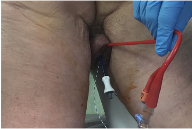
FIG. 2. Transurethral placement of bladder catheter, ureteral access sheath, and safety wire in preparation for ambulatory percutaneous nephrolithotomy.

17 cm clear renal sheath (Boston Scientific) was used to dilate the tract and maintain renal access during the procedure. All percutaneous maneuvers in achieving access, including needle and wire entry and tract dilation, were visualized endoscopically to provide an additional layer of safety and precision during these critical steps. Renoscopy and ureteroscopy were performed with a standard rigid nephroscope and flexible ureteroscope (Karl Storz, Tuttingen, Germany). Lithoclast (Boston Scientific) device and PercNCircle (Cook Medical, Bloomington, IN) stone retrieval device were employed in extracting stones. In addition to the stones visualized on CT, another two stones (2 and 3 mm) were identified endoscopically and extracted. Final endoscopic evaluation of the kidney was performed with a combination of antegrade and retrograde flexible scope renoscopy. Final ureteroscopy was performed as the ureteroscope and UAS were withdrawn in tandem. At this point, the urethral catheter was clamped to permit slight bladder dilation and the ureteroscope was positioned within the bladder, visualizing