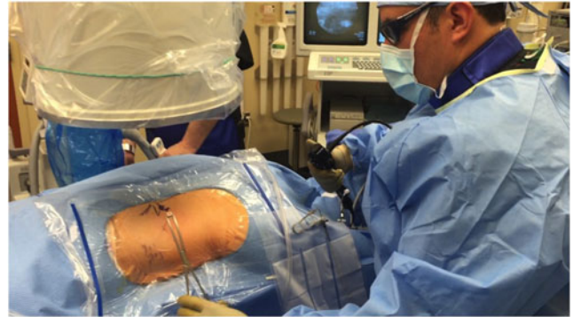
FIG. 4. Example of surgeon performing renal access utilizing a combination of ureteroscopic guidance and fluoroscopic radiographic guidance. (Note: photo shown is a left side procedure).

the operative side ureteral orifice. Ureteral stent was then deployed over wire appropriately positioned, coiled within the bladder, and renal pelvis visualized both endoscopically and radiographically. A dissolvable hemostatic plug was advanced down the renal access sheath into the renal access tract before removal of the access sheath. 5 Multilevel (11th and 12th) intercostal anesthetic nerve blocks are performed using 0.5% Marcaine. Incision was closed with 2–0 Vicryl followed by 3–0 Monocryl and skin glue. Anesthetic was reversed and patient was transported to the postoperative recovery area. Acetaminophen 1000 mg and ketorolac 30 mg were both given intravenous before leaving the operative suite. Total time in odds ratio was 1 hours and 57 minutes. Total fluoroscopy time was 42 seconds. Renal access time was one minute. Fifty milliliters blood loss was recorded. Patient was subsequently discharged home in <90 minutes.