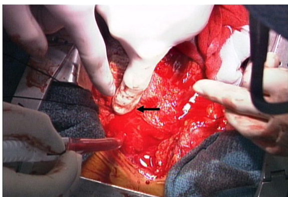
Figure 1 Operative view of the ruptured left ventricle. The major source of bleeding was a blowout rupture between the left anterior descending artery and its diagonal branch, which was controlled by manual compression (black arrow).