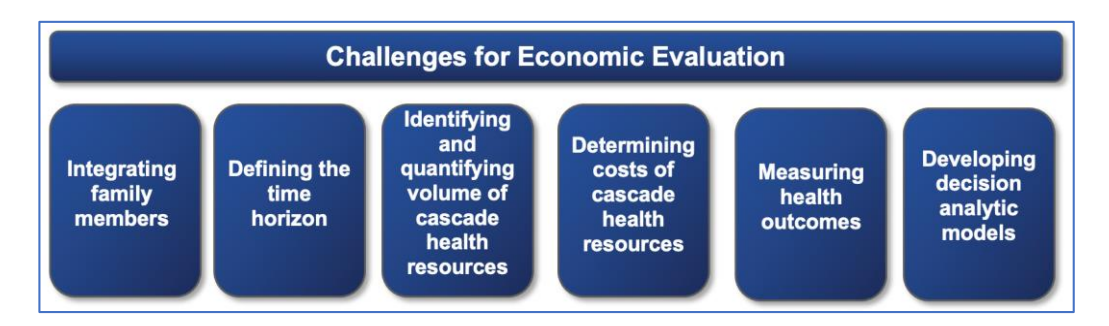
Figure 2. Challenges to economic evaluation methodology associated with incorporation of cascade effects in analysis.

Based on close examination of included studies, there are a number of methodological challenges common to economic evaluations of cascade effects; they are related to study design, costing, and measurement and valuation of health outcomes (Figure 2). These are summarized in Table 2, along with alternate suggested approaches.