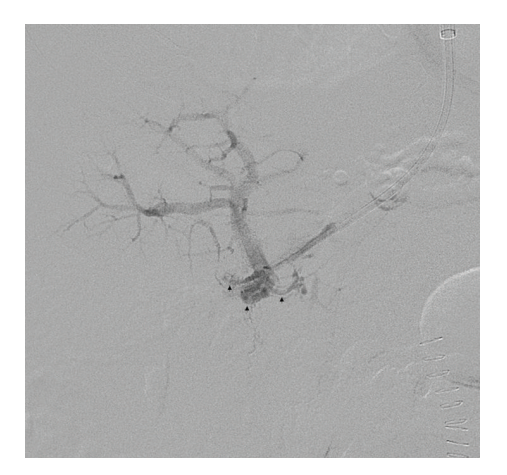
FIGURE 2: 62-year-old man with portal vein thrombosis with cavernous transformation. Angiogram following transjugular access to the portal system demonstrates access into a network of cavernous collaterals (arrows), with patent intrahepatic branches. The wire could not be navigated through the occluded main portal vein from this approach.

chronic pancreatitis, resultant portal vein thrombosis, and portal hypertension with recurrent variceal bleeding presented to the emergency room with several bouts of melanotic stool and one episode of large volume hematemesis. His blood pressure was 81/50, heart rate was 105, and hemoglobin was 6.0 (baseline 9.9). Aggressive volume resuscitation was instituted, and emergent endoscopy demonstrated large gastric varices which were not amenable to endoscopic therapy. CT demonstrated portal vein occlusion with cavernous transformation (Figure 1). A decompressive mesocaval shunt was attempted by surgery, but was unsuccessful. At surgery, diffuse plastic peritonitis was present throughout the upper abdomen, likely as a result of chronic pancreatitis. The vascular structures could not be isolated. Excessive bleeding occurred during the operation, requiring significant blood