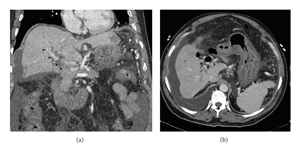
FIGURE 1: 62-year-old man with portal vein thrombosis with cavernous transformation. Preprocedural coronal CT image demonstrates complete occlusion of the main portal vein (arrows), with reconstitution of intrahepatic branches (arrowheads) (a). Preprocedural axial CT image better demonstrates the multiple cavernous collaterals at the level of the hepatic hilum (arrows) (b).