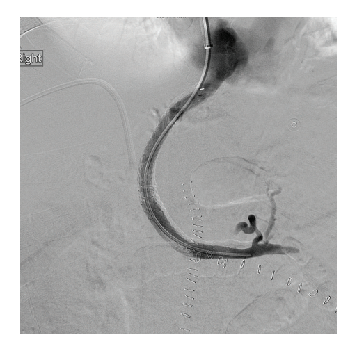
FIGURE 5: 62-year-old man with portal vein thrombosis with cavernous transformation. Rapid inline flow through the TIPS following stent-graft placement from the main portal vein to the proximal right hepatic vein and bare metal stent placement in the more proximal main portal vein. The final portosystemic gradient is 11 mm Hg.

TIPS procedure. One year after the TIPS, the patient is well, without further complications related to portal hypertension. The TIPS remains widely patent.