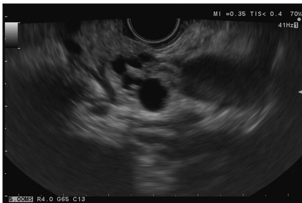
Figure 2 Fifteen mm cyst in the uncinus process. Communication with the pancreatic duct, typical of branch-duct intraductal papillary mucinous neoplasm, is observed