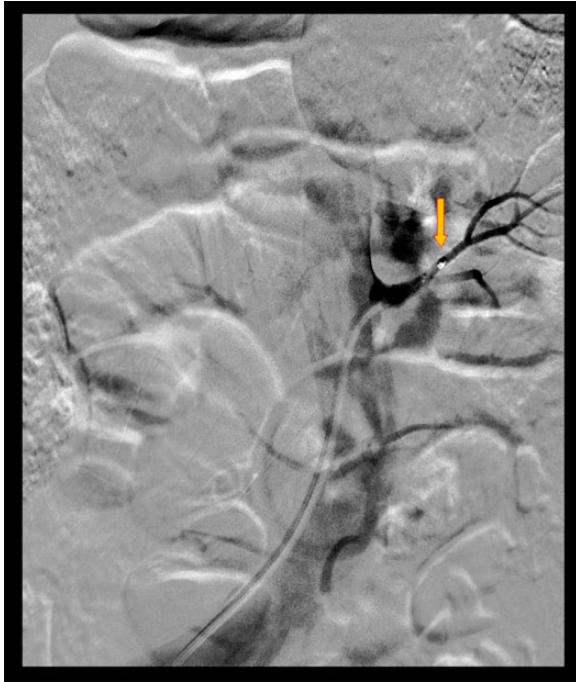
Fig. 1. Renal denervation of the native left kidney. The arrow points the tip of the radiofrequency ablation catheter. Filling of the renal arteries with contrast-agent is shown; however no filling of intrarenal parenchymal vessels is visualized.

and prednisolone 10 mg. Left ventricular hypertrophy was diagnosed using the ECG voltage criteria for left ventricular hypertrophy. No cardiac ultrasound was available.