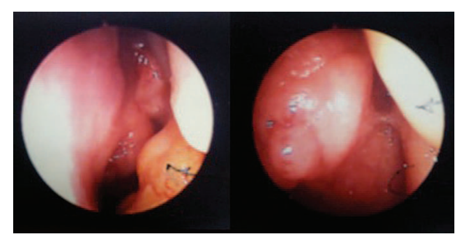
Figure 1: Images from left-sided rigid endoscopy demonstrating an abnormal cystic mass.