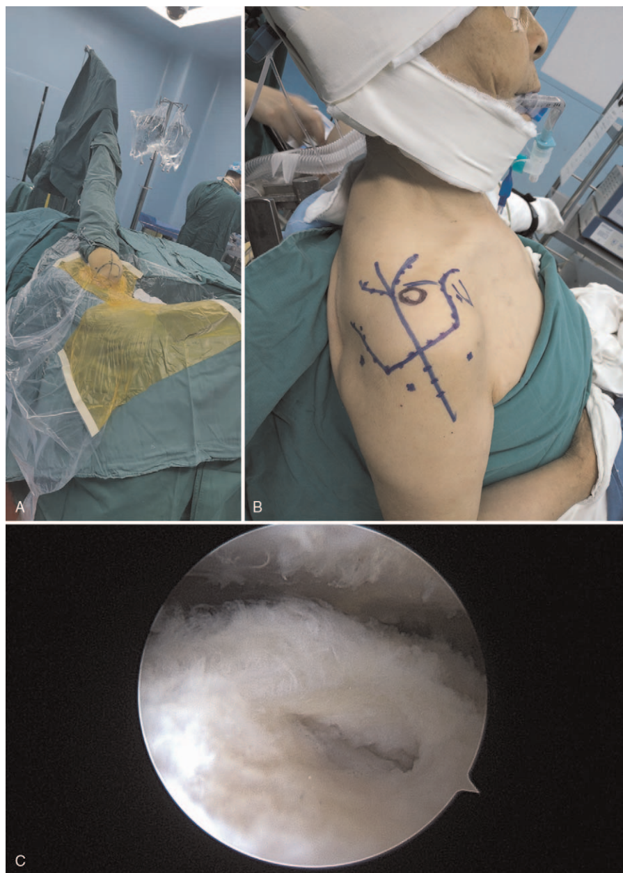
Figure 1. A: Lateral lying position. B: Beach chair position. C: Large rotator cuff injury. D: Acromion. E: Rotator cuff repair.

the healthy hand were initiated. After 2 weeks, the affected arm was supported and flexed to 90°, then swung anteriorly, posteriorly, and laterally under the protection of the healthy arm (1–2 min/d until 4–6 weeks after surgery, then 1–2 min twice/d thereafter). Passive activities could be performed for shoulder abduction, flexion, and lateral external rotation training. Independent active activities were permitted at 12 weeks after surgery. An ice compress was applied for 20 minutes after rehabilitation training, 2 to 3 times/d. All rehabilitation training was completed under the guidance of the same doctor.