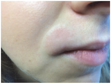
FIGURE 1: Patient presentation of two-centimeter, well-demarcated, pink-coloured oval plaque on the right cutaneous upper lip consistent with MCD.