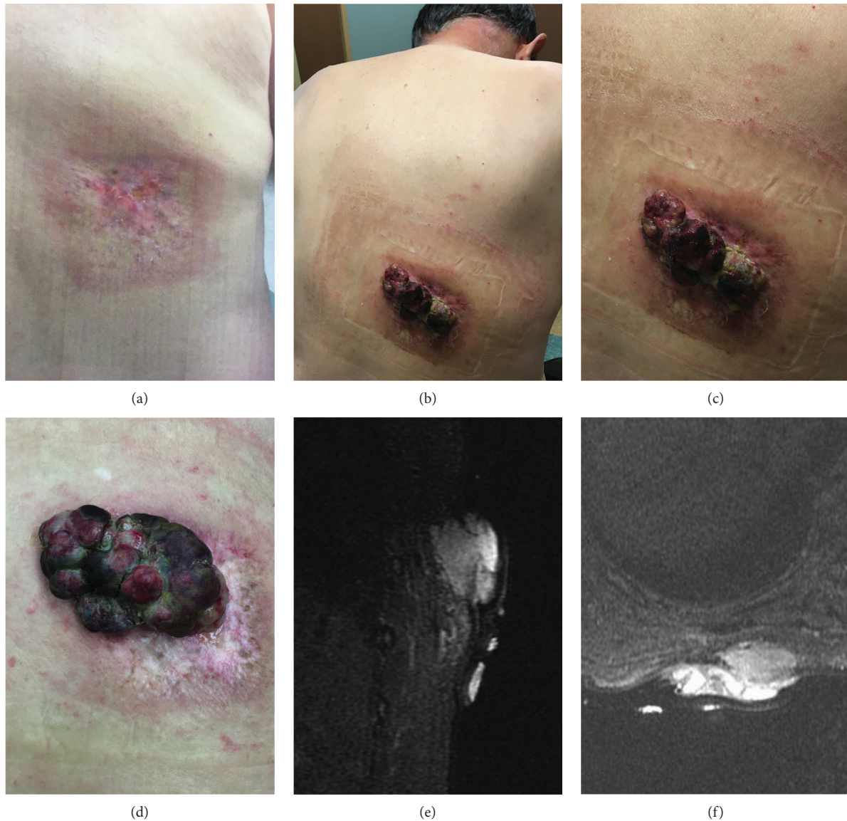
FIGURE 1: Gross imaging of the patient's mass: gross images of the area of ulceration which developed following cardiac catheterization photographed in 2014 (a) show no signs of growth. In 2017, a mass (b) demonstrating outward growth and the area of the radiation injury following a year of close observation with a superimposed image of the same (c) mass was obviously exophytic and purulent measuring 5 \times 3 cm at the time. The mass was photographed again prior to surgery two months later (d) in addition to MRI imaging shown with sagittal (e) and axial STIR (f) imaging demonstrating T1 signaling slightly intense to muscle and heterogeneous T2 signaling with avid contrast enhancement at the level of the posterior T10 rib. Both images fail to show evidence of muscular or bony invasion.

presentation, the area was flat and biopsies revealed no evidence of malignancy. Upon presentation to us, however, the physical exam demonstrated a fungating mass approximately 5 \times 9 cm with central purulent necrosis and induration surrounding the periphery (Figures 1(b)–1(d)). No additional nodularity or adenopathy was found on physical exam initially. At this time, punch biopsies demonstrated undifferentiated pleomorphic sarcoma along with frankly necrotic debris.