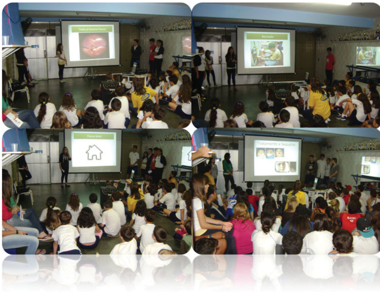
Fig. 3 Practical activity: disseminating knowledge.

the program, the rate of correct answers obtained was 97.6%, with nearly 100% of the participants showing that they achieved a better understanding about CLP.