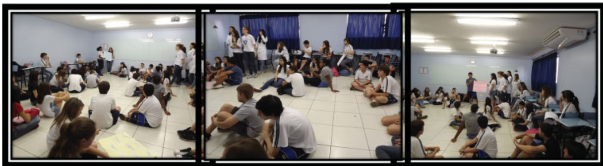
Fig. 2 Practical activity: group quiz.

The questions that addressed definition (question 1), embryology (question 3), etiology (question 4), and treatment (question 8) of CLP showed the lowest rates of correct answers before the YDP. After the program, the correct answers for these questions increased ~50% overall. Question 3 showed one of the lowest increase rates after YDP. These findings can be explained due to the difficulty of the assimilation of content related to embryologic information at the middle school level, because this content is generally addressed with students at the high school level in Brazil. 15 The results for question 1 are noteworthy. This question showed the lowest rate of correct answers before the YDP (9.8%). After