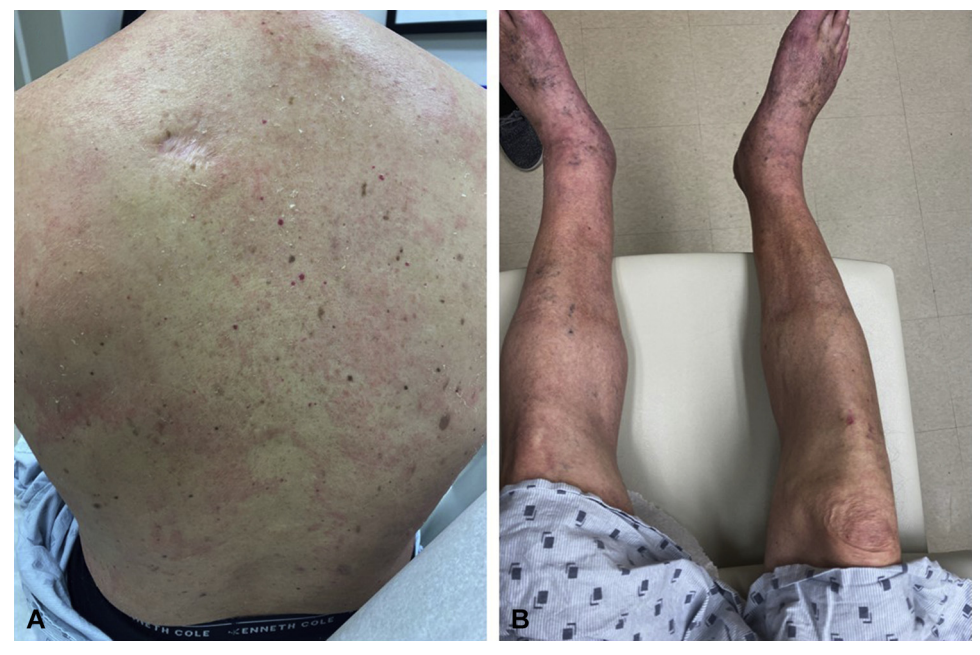
Fig 3. Markedly reduced density and decreased intensity of erythematous plaques on the torso and extremities (A and B) compared with the initial presentation (Fig 1). Improving lower extremity edema was also seen (B) but not pictured in Fig 1.