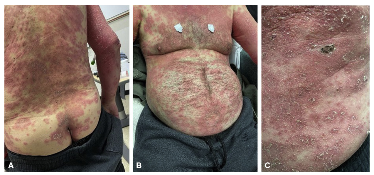
Fig 1. Widespread, erythematous plaques (A and B) with small, non-follicular pustules and scale (C).

Physical examination revealed a generalized distribution (50% of the body surface area) of erythematous plaques, studded with numerous small, non-follicular pustules (Fig 1). The rash spared the face, genitals, and mucosae. Significant acral swelling was observed in the absence of palpable lymphadenopathy.