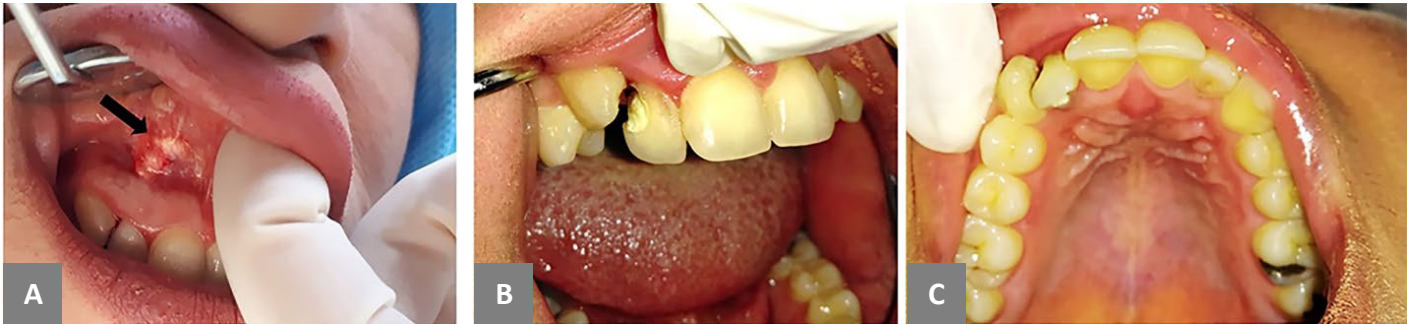
Figure 2. Intra-oral examinations: A) A white-colored prominence near the mucogingival junction of tooth #7, B) Buccal view of tooth #7, C) lingual inclination of tooth #7

She didn't accept the treatment plan and was referred to the department of endodontics, School of Dentistry, Tehran University of Medical Sciences.