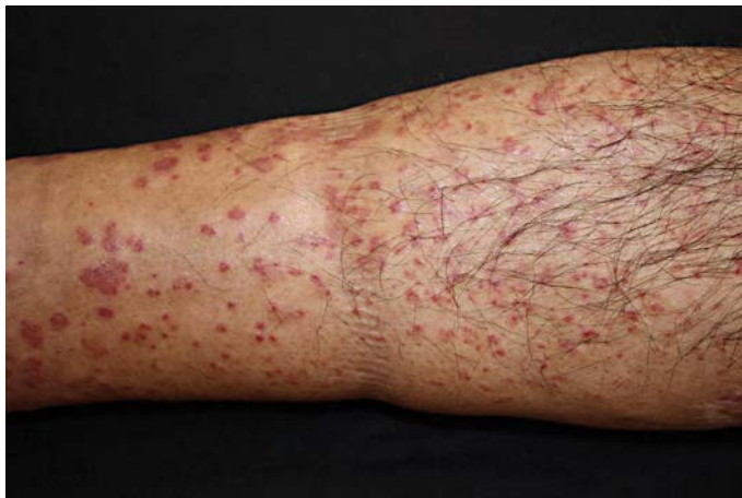
Fig. 1. Clinical features of lower extremities. Palpable purpura progressed, turning into blisters and forming retiform ulcers.

The authors have no conflicts of interest to declare.