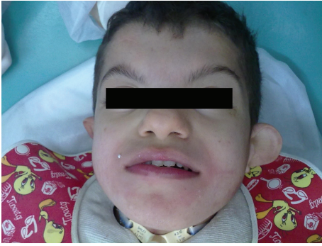
FIGURE 1: Facial characteristics of the patient: facial asymmetry and bilateral malformations of the ear.