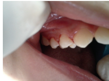
FIGURE 4: Oral manifestations after treatment.

dental health team used a high-powered suction system to aspirate the tartar fragments detached by manual scraping. This procedure was selected because of the risk of inhaling fragments; thus, one aspirator was placed in the oral cavity, and another was placed in the tracheostomy access.