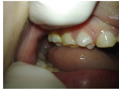
FIGURE 3: Oral manifestations: presence of dental calculus.

When establishing an assistance protocol, our first concern was to help decrease the recurrent bouts of pneumonia, and for this reason, the protocol involved the use of chemotherapeutic agents combined with the manual removal of visible tartar (Figure 4). Accordingly, before any clinical intervention, antimicrobial therapy was performed using 0.12% chlorhexidine followed by the manual removal of tartar. During the mechanical removal of dental calculus, the