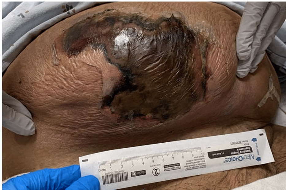
FIGURE 1: Lower abdominal wall wound at the time of initial presentation