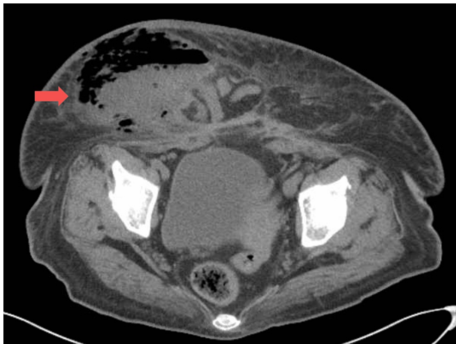
FIGURE 2: CT image demonstrating a large ventral hernia with an overlying abscess and prominent, associated soft tissue gas (arrow)