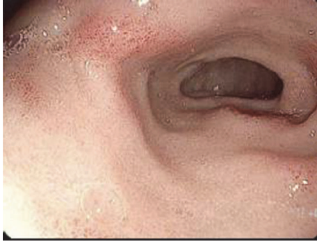
FIGURE 1: Endoscopic appearance of duodenal inflammation consistent with chronic GVHD on biopsy. This patient also had similar lesions in the gastric antrum to that depicted in this figure.

etiology due to its ubiquity in the existing literature. Here, we present the first case of HSCT-GAVE in a patient that was treated with a non-busulfan-containing conditioning regimen. We argue that it is a form of GVHD instead of a sequela of the transplantation conditioning regimen.