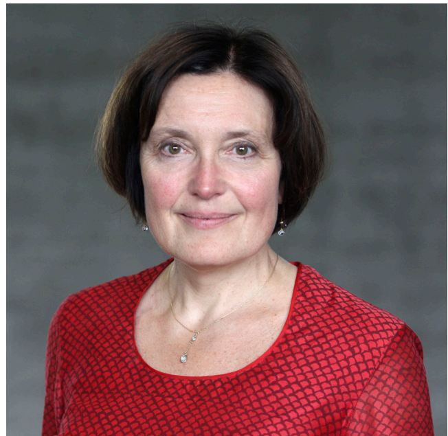
Suzanne Eaton.

In subsequent work, they extended their analysis to demonstrate that shortly after prepupal stages forces, caused by contraction of the wing hinge region, exert long-range influences on the wing proper by inducing elongation of cells and thus narrowing of the wing tissue, mediated by cell shape changes, cell rearrangements, and cell divisions. Thereby,