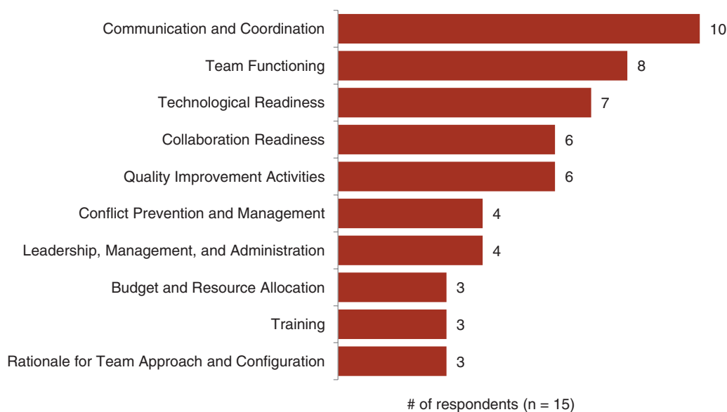
Fig. 1. Areas of collaboration planning that respondents anticipated using the most in future collaborative work.

planning would position the team for success. The role of the evaluator (LS or SS) was to observe the sessions, note any questions on the worksheet that did not seem to make sense to the team members, and make overarching observations about the direction of the conversation. The evaluator did not actively participate in the discussion. After each meeting, attendees received a short survey (Appendix C) soliciting feedback about their experience with collaboration planning, including the areas they thought themselves most and least likely to use, as well as whether they found the overall experience valuable. Team PIs were asked to submit a written Collaboration Plan with their first pilot award quarterly progress report, following the general format of the Collaboration Planning worksheet. These plans were analyzed for common themes (BR). We did not assess the process teams followed in creating the plans after our session, nor did we attempt to judge the “quality” of the plans, as we currently lack a priori criteria by which to do so. Teams have not received any feedback on their plans.