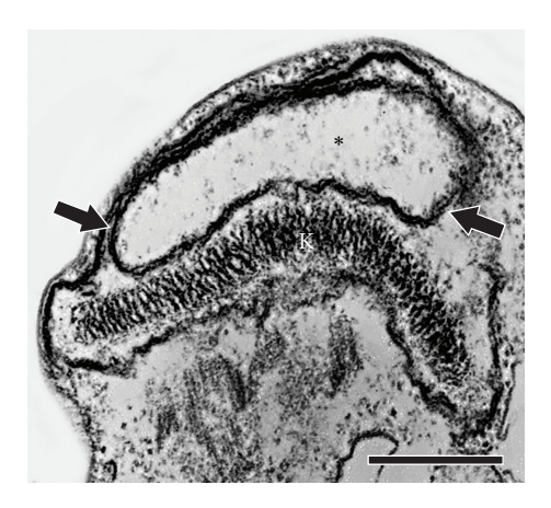
FIGURE 3: Common drug effects on the pathogenic trypanosomatid mitochondrion. Treatment with a naphthoquinone leads to mitochondrial swelling (asterisk) and the appearance of concentric membranar structures inside the organelle (arrows). K: typical morphology of the kDNA network. Bar: 200 nm.

The mitochondrial metabolism of Leishmania spp. amastigotes and promastigotes, T. cruzi trypomastigotes and epimastigotes, and T. brucei procyclic forms is similar [53]. The inhibition of certain potential targets is associated with triggering apoptosis-like effects by MMP impairment and/or ROS production. The mitochondrial targeting of drugs may rely on free-radical production and/or calcium homeostasis [116].