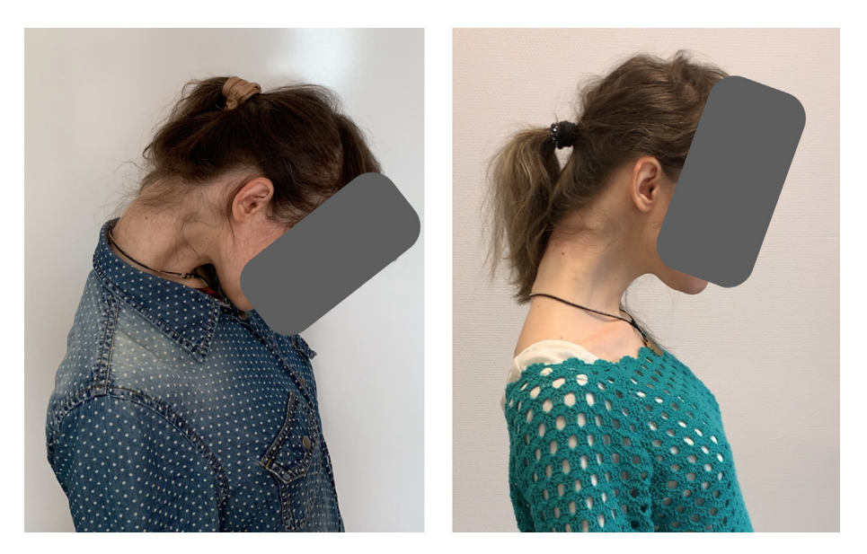
Fig. 2. Patient 1 before and 4 weeks after the BoNT injection to LCo at both sides.

lis onset. ADL, such as personal hygiene, mobility, and communication skills, were impaired. No pre-treatment dysphagia was reported. Four weeks following OnaB injection to LCo at the both sides (40 U each), along with improvement in posture, mobility, and communication abilities, he also developed moderate dysphagia, which regressed within 1.5 months. In addition, the patient reported slight difficulties in maintaining an upright neck posture, even though he did not show any neck extensor weakness and serum CK was normal during initial examination. Therefore, his