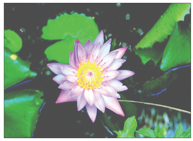
Figure 1: Nymphaea stellata

N. stellata is commonly known as Indian blue water lily / Indian water lily in English and has different vernacular names in India [Table 1].<sup>[19]</sup> Sometimes this water lily is often referred as 'blue lotus of India', but it is not a lotus.<sup>[15]</sup> Many reports specify that 'blue lotus of the nile' and the 'blue lotus of India' are N. caerulea and N. nouchali , respectively, while others report 'sacred blue lily' as Nymphaea nouchali var. caerulea. In India the vernacular