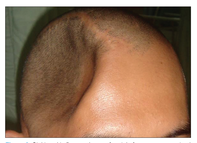
Figure 2: Sinking skin flap syndrome after right frontotemporoparietal decompressive craniectomy