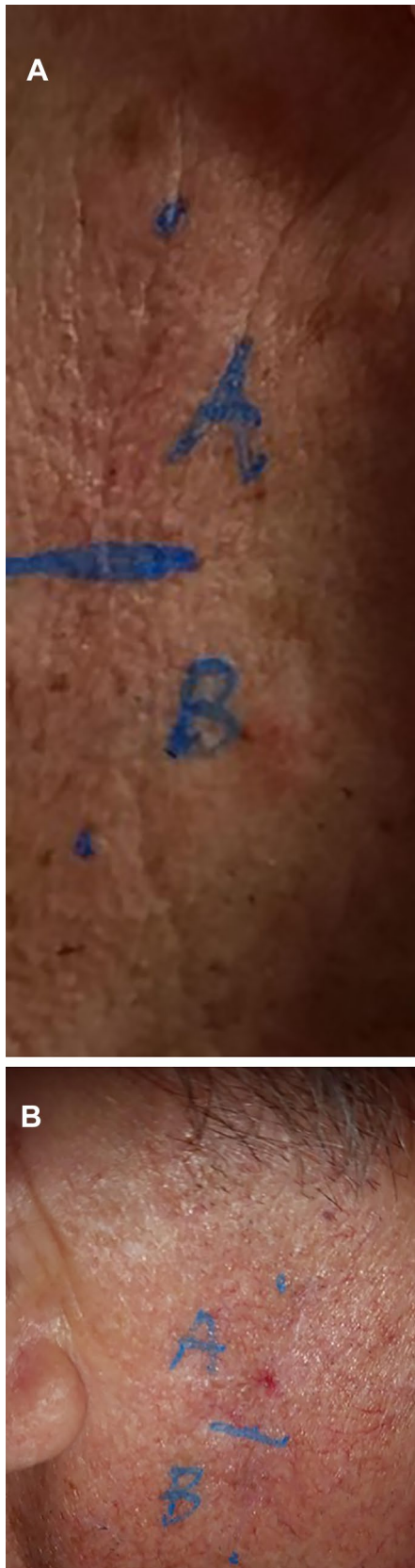
Fig. 2 Clinical images of representative subject outcomes assessed at 3 months. A (Right lateral neck) Side A was undermined. B (Right cheek) Side A was undermined