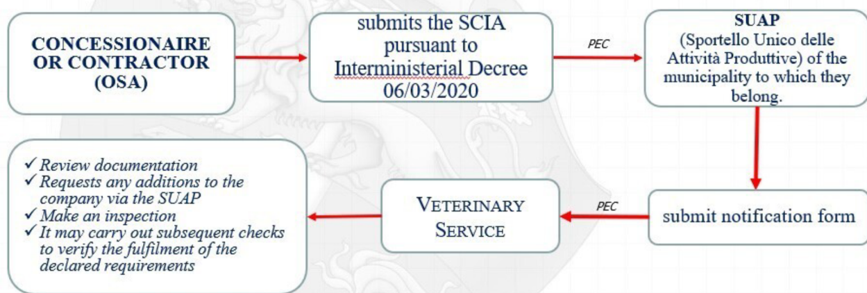
Figure 2. Procedure in case of food and beverage processing and administration operations conducted under outsourced management. SCIA, certified activity start notice; OSA, food business operator; SUAP, single desk for productive activities; PEC, certified e-mail.

The FBO must provide good hygiene practice manuals drawn up according to the principles of the hazard analysis and critical