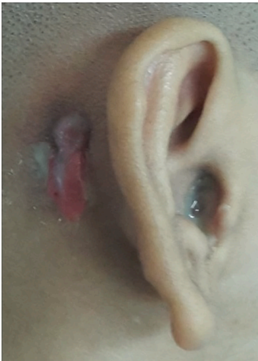
Fig. 1. Retroauricular abscess in one of the cases.

through the eustachian tube, hematogenous spread, contact from adjacent intracranial or extracranial infected foci, directly through the external acoustic canal through perforation of the tympanic membrane [10].