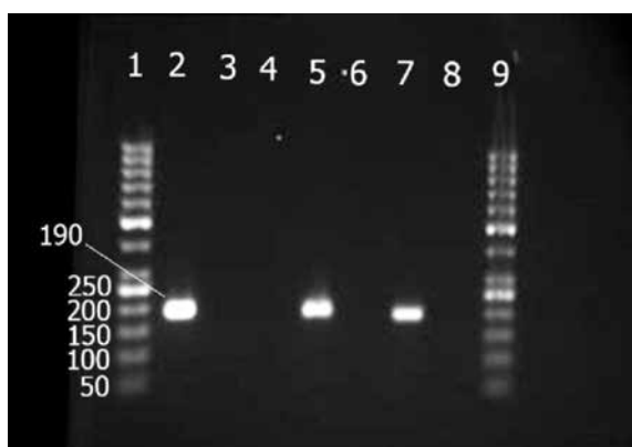
Fig. 3. Electrophoresis results of ermC gene. Lanes 1 and 9: 50 bp DNA ladder, Lanes 2 and 5: isolates with ermC gene in 190 bp, Lanes 3, 4 and 6: isolates with negative ermC gene. Lanes 7 & 8 positive and negative controls, respectively.

positive for both ermA and ermC . Three isolates had D phenotype while the results of erm genes PCR were negative. All isolates were negative for ermB and msrA genes. The result of PCR for erm genes according to sensitivity to methicillin is shown in Table 3.