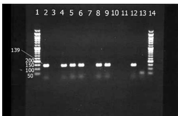
Fig. 2. Electrophoresis results of ermA gene. Lanes 1 & 14: 50 bp DNA ladder, Lanes 2,4 - 6 and 8-9 isolates with ermA gene in 139 bp, Lanes 3, 7, 10-11 isolates with negative ermA gene. Lanes 12 & 13, Positive and negative controls respectively.