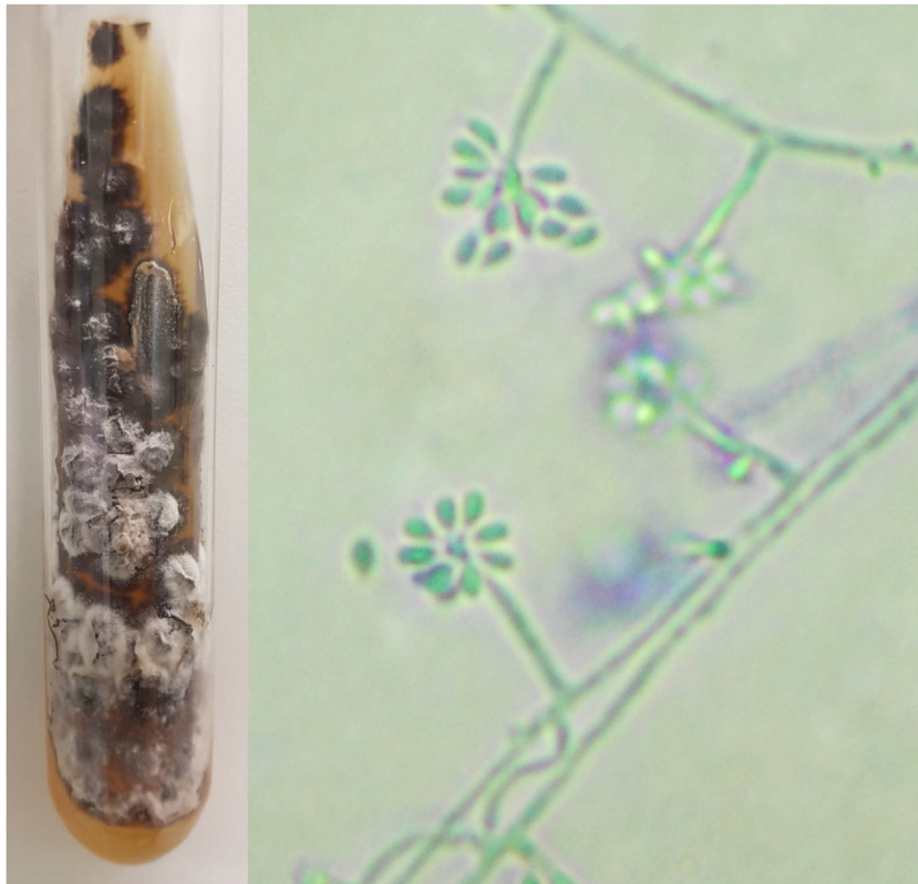
Figure 2 Phenotypic aspects of Sporothrix sp. Macromorphology on Mycosel agar medium at 25°C with white to beige and black bicolor filamentous colony, and potato agar micromorphology (cotton blue, \times 400 ) showing hyaline septate hyphae with conidiophores, with hyaline conidia at the extremities in a "daisy" arrangement.

All patients were treated with oral medication, with options of choice being a saturated solution of potassium iodide, itraconazole, and terbinafine, in single or associated use, with variable dose and duration in each case. These are all drugs indicated for the treatment of this infection for localized cases in immunocompetent patients; however, the fact that these medications were not supplied at the service where the appointments took place and the difficulty for patients to find the medication available for free in the public health network did not allow a standardization in order to present the findings in an organized manner. 2,4 However, in all cases, clinical cure was reached with the prescribed treatments.