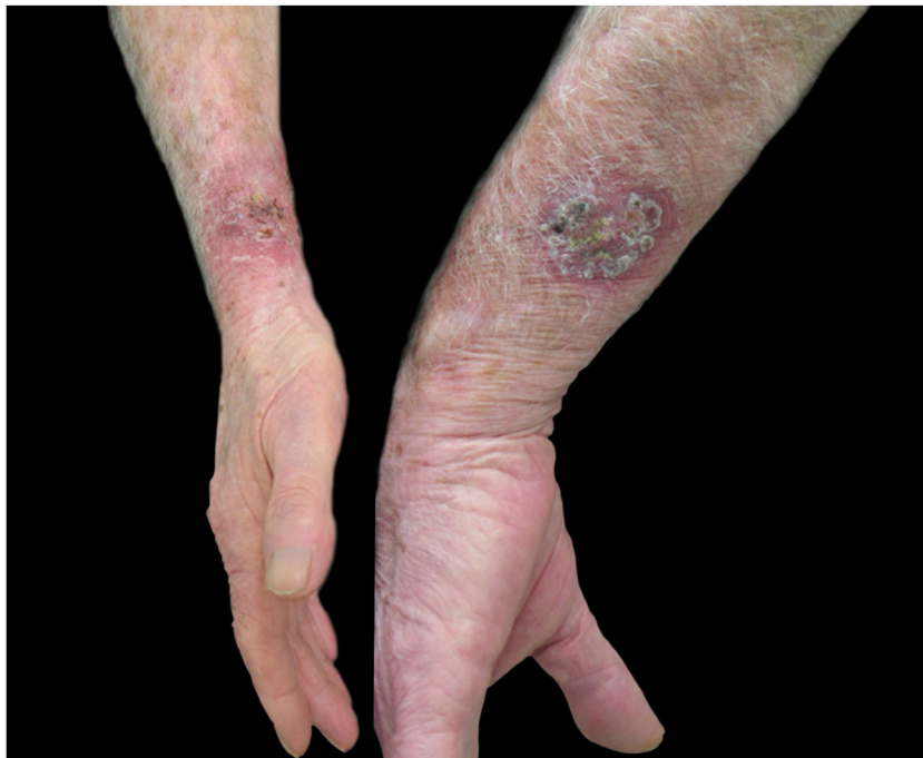
Figure 1 Sporotrichosis, cutaneous form of multiple inoculation in both forearms presented by case 16.

that the gold standard method for the diagnosis of sporotrichosis is the culture and identification of species of the genus Sporothrix based on the material collected from skin lesions. 2,4,9 In all cases presented here, the culture was identified phenotypically, by colonies with a membranous aspect