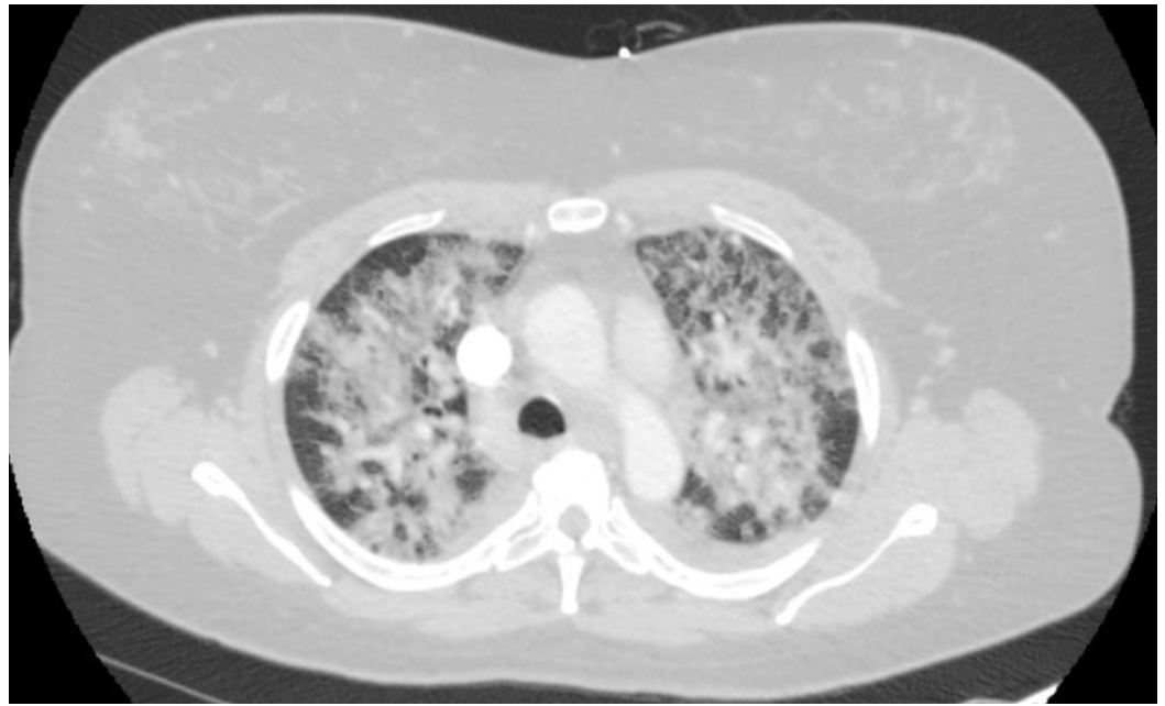
FIGURE 3: CTA chest showing bilateral alveolar opacities