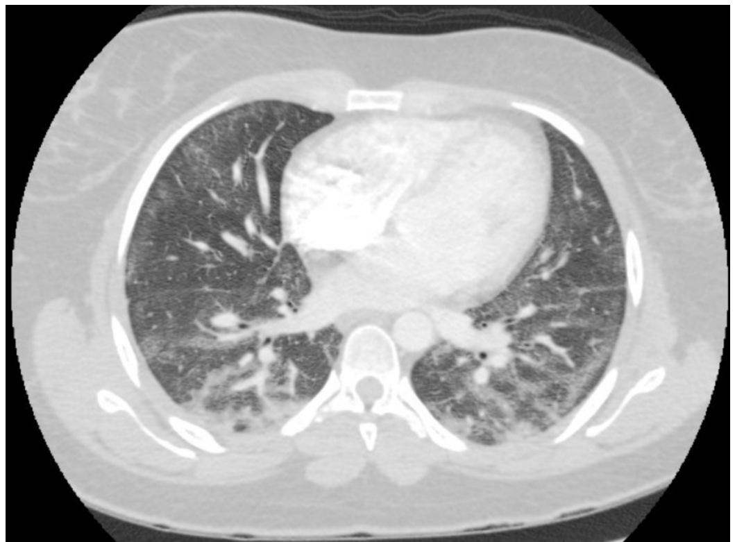
FIGURE 1: CTA chest showing bilateral ground-glass opacities