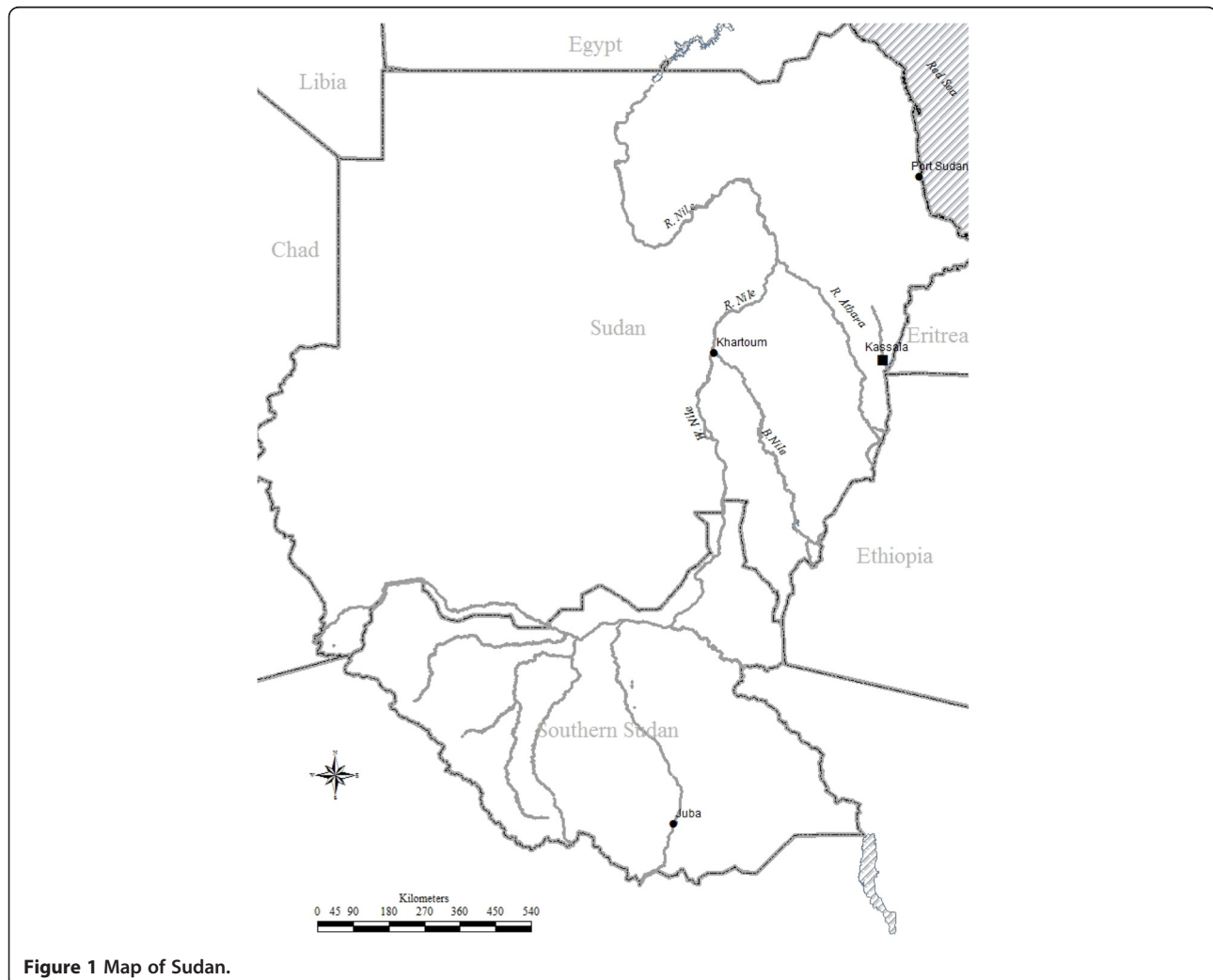
Figure 1 Map of Sudan.

This observational (without sample size calculation) clinical trial was conducted at the Fatima Eldeig Health Centre in Kassala, eastern Sudan (located 600 km from Khartoum, Sudan) and took place from October to December 2011 (Figure 1). The World Health Organization (WHO) guidelines for assessment of the efficacy of anti-malarial drugs were adopted [19]. Febrile patients (axillary temperature \geq 37.5^{\circ}\text{C} ) with confirmed blood films for P. vivax mono-infection and willing to participate in the study were enrolled. Those individuals with severe malnutrition, pregnancy, or with a history of allergy and/or intolerance to the drugs were excluded. Informed consent was obtained from all of the patients, or in the case of children, their guardians. Structured questionnaires were used together