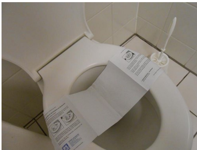
Fig. 2 ◀ Stool collector used for on-site and home collection made of water-soluble recycling paper (Med Auxil)]

cessing were essentially the same as in the planned baseline assessments of the GNC. In communicating the project to the participants it was explained that the collection of fresh stool samples on site would be of great scientific benefit because fresh material offers the best quality for certain laboratory analyses. Additionally, in Hannover the convenience of on-site collection was emphasized in that all materials were ready to be used, and no additional time and effort would be required later at home.