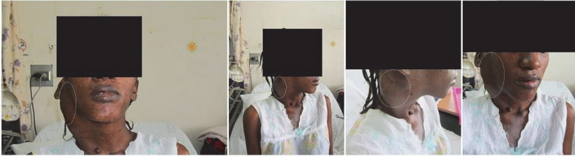
FIGURE 1: Facial depiction of the hematoma. Frontal series of the right neck hematoma (eclipsed in white), resulting from dissection of the right external carotid pseudoaneurysm.