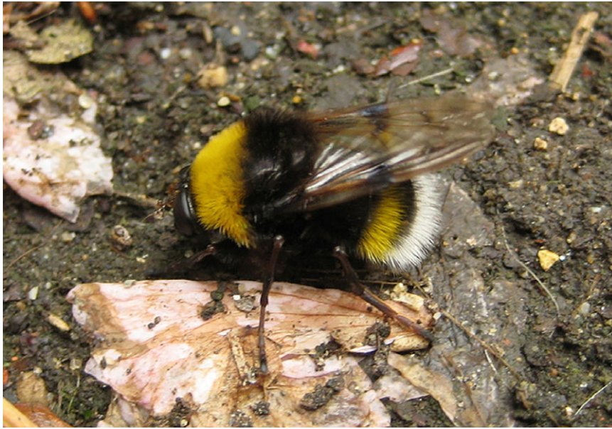
FIGURE 1 Pocota personata , Abney Park, Stoke Newington, London (2013). [Colour figure can be viewed at wileyonlinelibrary.com ]

Pocota personata is associated with old trees, where its larvae can develop in so-called “rot holes” after fallen branches have left behind a distinctive micro habitat. The term saproxylic, derived from the Greek σαπρός ( saprós ) meaning “putrid,” refers to organisms that depend on ecological niches derived from damaged or hollow trees, rotten wood, and their associated fungi. In the UK alone, more than 1,500 species of beetles and flies are dependent on saproxylic habitats, and many of these species are rare or highly restricted in their distribution. Although the conservation value of saproxylic habitats is now recognised internationally as one of the most distinctive features of woodland ecology very few sites enjoy some form of legal protection in the UK or elsewhere on the basis of their saproxylic fauna alone. 8