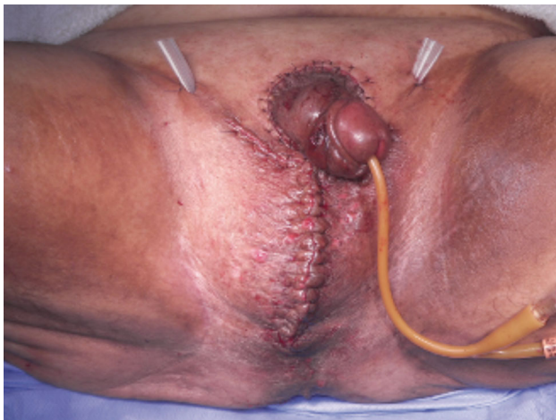
Fig. 2 Postoperative result.