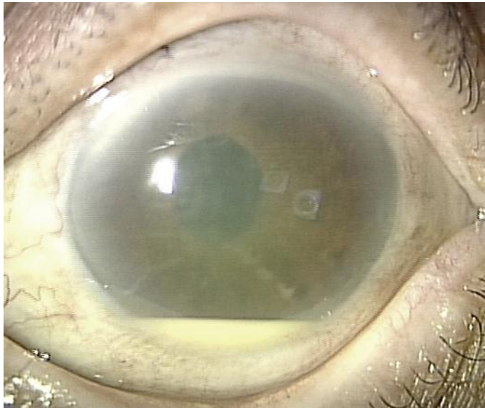
Fig. 1. Anterior segment findings 4 weeks after cataract surgery. Hypopyon and fibrin formation in the anterior chamber and many mutton-fat keratic precipitates are observed.