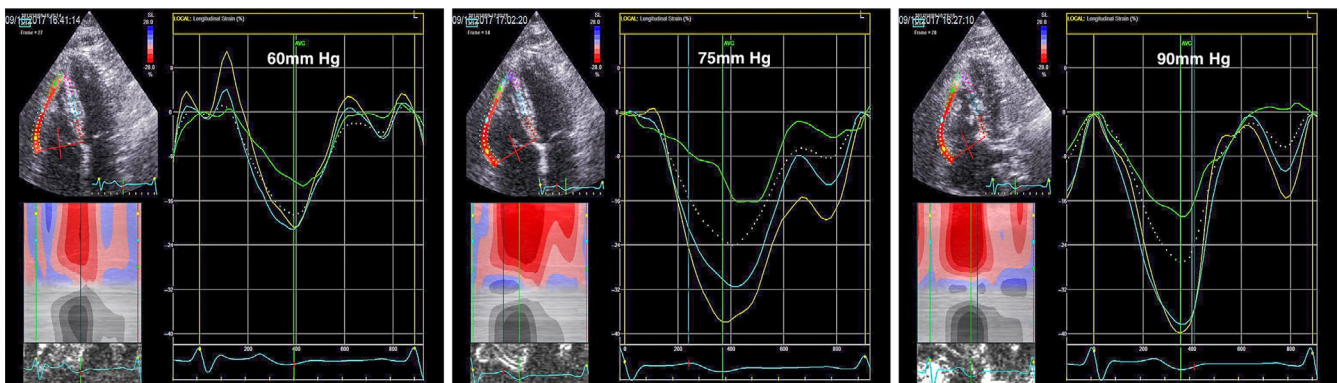
FIGURE 2 Shows four-chamber recordings of RV free wall longitudinal strain from a septic shock patient at norepinephrine-induced changes in target mean arterial pressure of 60, 75 and 90 mmHg, respectively [Colour figure can be viewed at wileyonlinelibrary.com ]

Abbreviations: MAP, mean arterial pressure; IQR, interquartile range; NA, not applicable; LVSWI, left ventricular stroke work index; RVSWI, right ventricular stroke index work index; PVRI, pulmonary vascular resistance index; SVRI, systemic vascular resistance index.