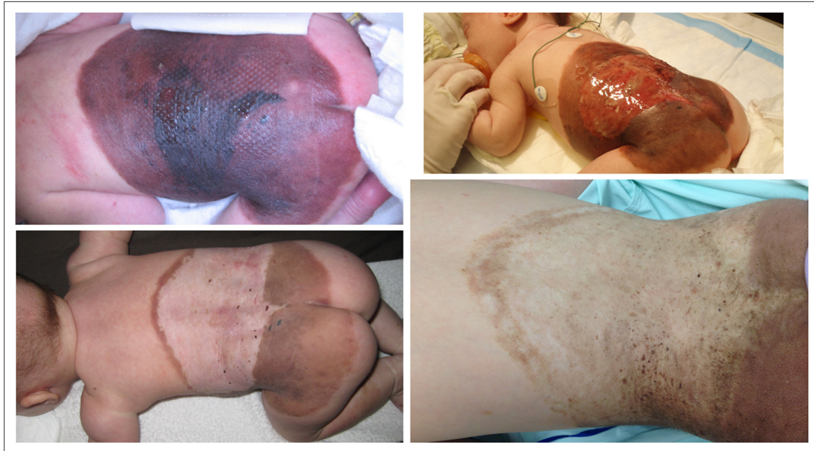
Figure 2. Case 7 demonstrating (a) dark black to brown giant congenital melanocytic nevus at birth with focal areas of ulceration (b) partially curetted nevus in neonatal period (c) healed site of curetted nevus to the back at 3 month follow up, and (d) curetted nevus to the back with mild speckled repigmentation at 9 years of age.

curetting scalp nevi. Curettage may therefore best be utilized for L-GCMNs on the trunk or extremities, with simple observation preferred for scalp nevi and surgical excision for the face for optimal cosmetic and functional outcome if removal is desired by the parents and/or patient.