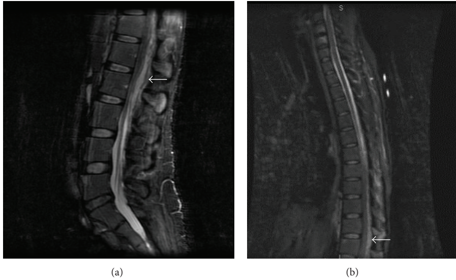
FIGURE 1: MRI of the lumbosacral spine (panel (a)) and thoracic spine (panel (b)), sagittal view: complex posterior epidural collection extending from lumbar L4 level cephalad into thoracic T7 associated central canal compromise and findings consistent with epidural abscess.