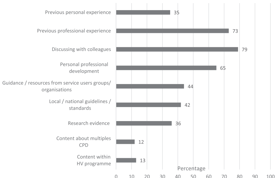
FIGURE 1 Factors influencing health visitor practice with multiple birth families

findings were echoed in relation to continuing professional development with 80% of respondents not attending any sessions related to multiple birth families. Consequently, the respondents relied primarily on “professional experience” (73%) and “discussion with colleagues” (79%) to inform their practice with multiple birth families (Figure 1).