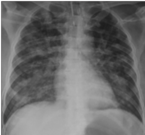
Figure 1: Donor Lung CXR: Before optimisation (Original)

Hormonal resuscitation therapy with methylprednisolone, vasopressin, and thyroid hormone has been associated with brain-dead donor stabilization and a better retrieval rate.