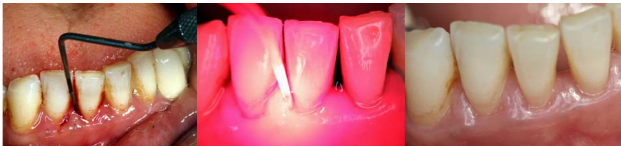
Figure 1 Patient with chronic periodontitis before treatment (left), during photodynamic therapy (middle) and six months after treatment (right).

At baseline, the probing depth was 5.9 \pm 0.8 mm (SRP) or 6.4 \pm 0.8 mm (SRP/PDT). Both after the treatment with SRP alone, and with the combined treatment with SRP, followed by photodynamic therapy (PDT), a clear improvement in the measured probing depths was observed over an observation period of six months. As is shown in Figure 3, already after four weeks for SRP therapy alone a mean reduction of the pocket depths by 1.3 \pm 0.4 mm, and for the combination therapy of SRP + PDT a mean decrease in the probing depths of 1.5 \pm 0.6 mm was found. However, after an observation period of six months, the combined therapy SRP + PDT showed with a mean reduction in probing depths of 2.9 \pm 0.8 mm a statistically