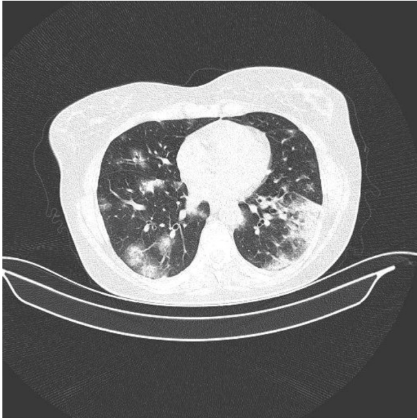
FIGURE 1: Axial CT image shows bronchocentric and nodular organizing pneumonia patterns and ground-glass opacifications.