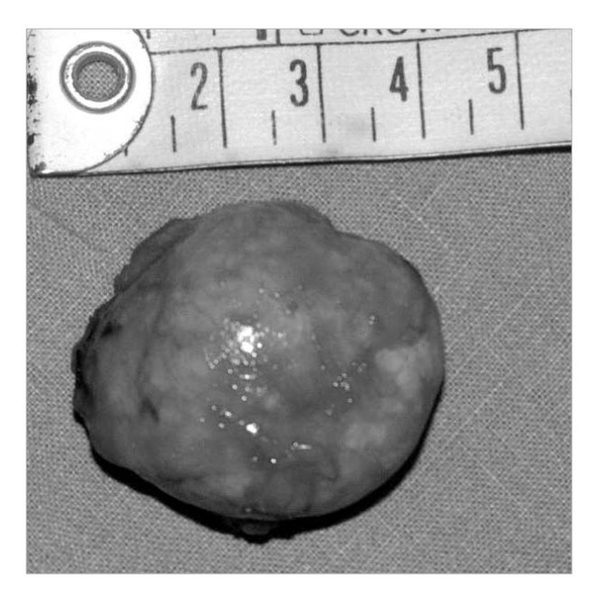
Fig. 2. Gross operative specimen showing a 3 \times 3 cm exophytic adrenal mass excised from the left suprarenal area.

pertensive drugs including spironolactone, atenolol and amlodipine with which stable blood pressure control was achieved. She underwent left adrenalectomy under general anesthesia and the exophytic mass was resected. Patient tolerated the procedure well and made a good post operative recovery. Operative specimen and histopathology was consistent with adrenal adenoma (Fig. 2, 3).