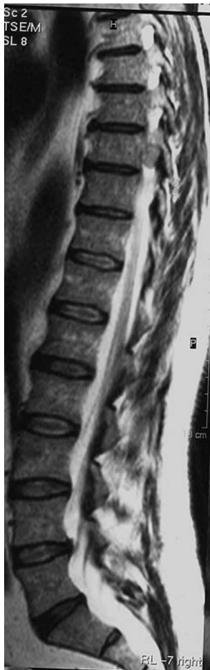
Fig. 2 Sagittal T2-weighted MRI showing T9–T10 right intervertebral foramen occupied by the tumor