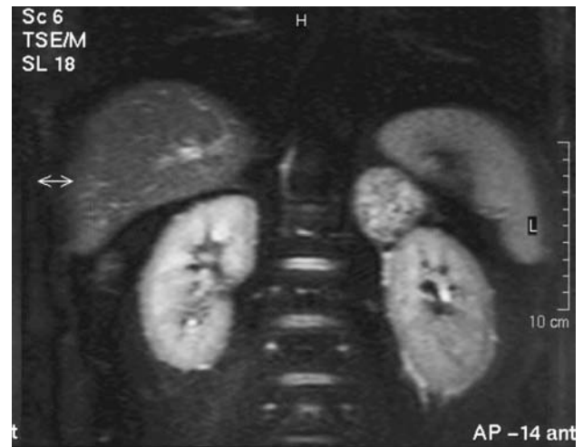
Fig. 3 Coronal abdominal spectral fat saturation inversion recovery (SPIR) MR images showing left suprarenal swelling

The schwannomas are benign tumors originating from Schwann cells which constitute the nerve sheath. The first case was described by Bjornboe [13, 15] in 1934 in a patient with neurofibromatosis type I. There are two distinct types of melanotic schwannoma: the sporadic and the psammomatous melanotic schwannomas of Carney complex [8, 14, 24, 27, 29, 36]. In 1985, Carney