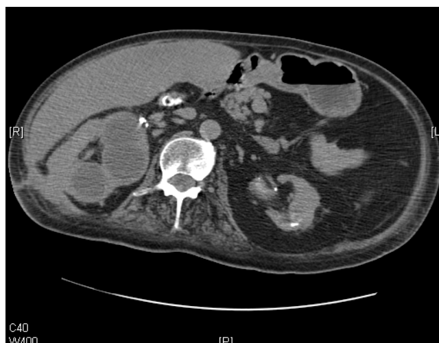
Figure 2 Axial CT scan of the abdomen, performed on 5 March 2007. Cysts in upper pole of right kidney are shown, the largest measuring 7 cm. In contrast to Figure 1, there was a marked loss of fat plane between the mid-pole of the right kidney and the postero-lateral abdominal wall.